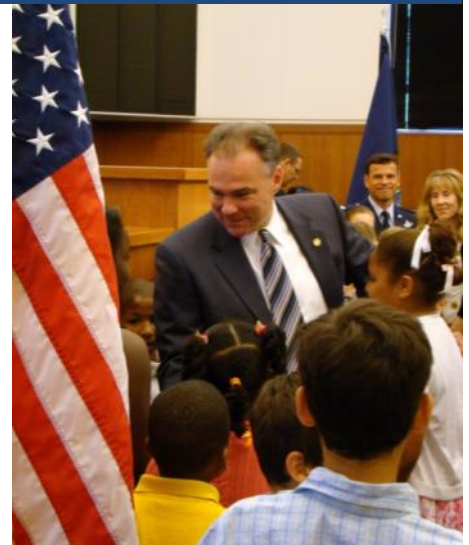
Gov. Kaine greets children of service members after signing the Interstate Compact on Educational Opportunity for Military Children. June 16, 2009.

Virginia has one of the nation's highest concentrations of active duty military and more than 800,000 veterans.