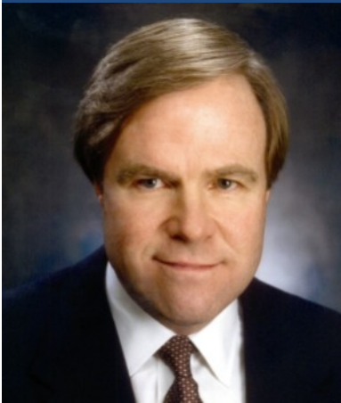
The Honorable Joe Reeder, VNDIA Chairman

The Virginia National Defense Industrial Authority (VNDIA) was created during the Virginia General Assembly's 2005 session to provide "technical assistance and coordination between the Commonwealth, its political subdivisions, and the United States government military and national defense activities located within the Commonwealth." Code of Virginia § 2.2-2328 .