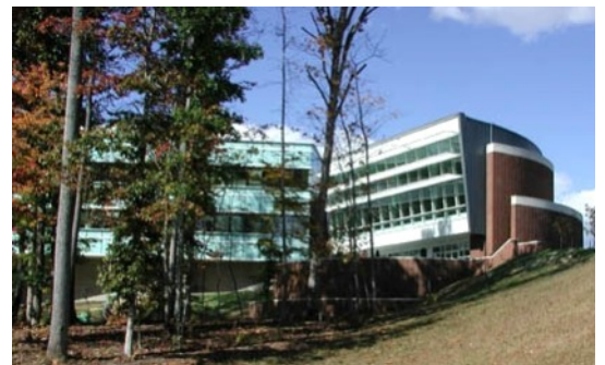
NGIC, part of Fort Belvoir but located in Albemarle County, provides scientific and technical intelligence to the Army and other defense partners.

In preparation for the growth at Rivanna Station, VNDIA recommended a $401,000 grant to Albemarle County through Virginia's Military Strategic Response Fund. Approved by Gov. Kaine, the grant will help purchase fire fighting equipment that will better prepare the county to respond to emergencies at these key military facilities.