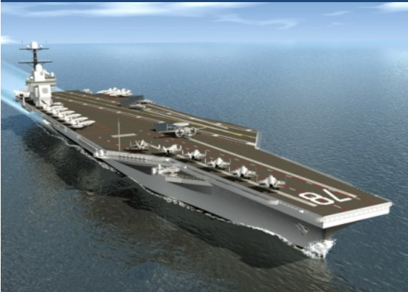
USS Gerald R. Ford (CVN-78), shown in this Navy rendering, is to be the lead ship of a new class of Navy aircraft carrier. The Ford is scheduled for completion in 2015. Both the Ford and the new USS George H. W. Bush (CVN-77), have the potential to be homeported at Norfolk.

Earlier this year the Navy released an Environmental Impact Statement (EIS) for Naval Station Mayport, Fla. An EIS is a document required by the National Environmental Policy Act (NEPA) that must be completed before the federal government takes "action significantly affecting the quality of the human environment."