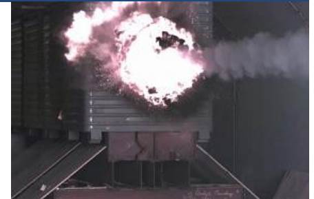
The rail gun at impact